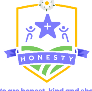
We are honest, kind and show integrity